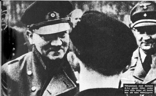
Hitlarmannen med Axmann. Enligt Axmann följde under den sista dagen ett besök hos sin nära förmyndare.

Här följer andra avsnittet i vår uppmärksammade serie om nazismens undergång för 20 år sedan. Fortfarande är det Artur Axmann, Hitlers förtrugne som berättar. Den pompösa tonen är inte att ta fel på. Axmann som i dag är köpmän i Berlin, ser fortfarande upp till Hitler och hans banditer. Men det gör inte hans skildring mindre spännande. Stortysklands undergång var en stor katastrof fullt jämförbar med Kartagos förstöring.