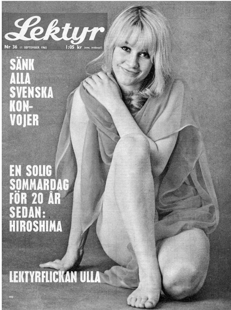
Remembering a sunny day in Hiroshima twenty years before ( Lektyr 1965:36).

the concept of circulation makes it possible to study the role of the nation-state as an actor in the transnational process. 9